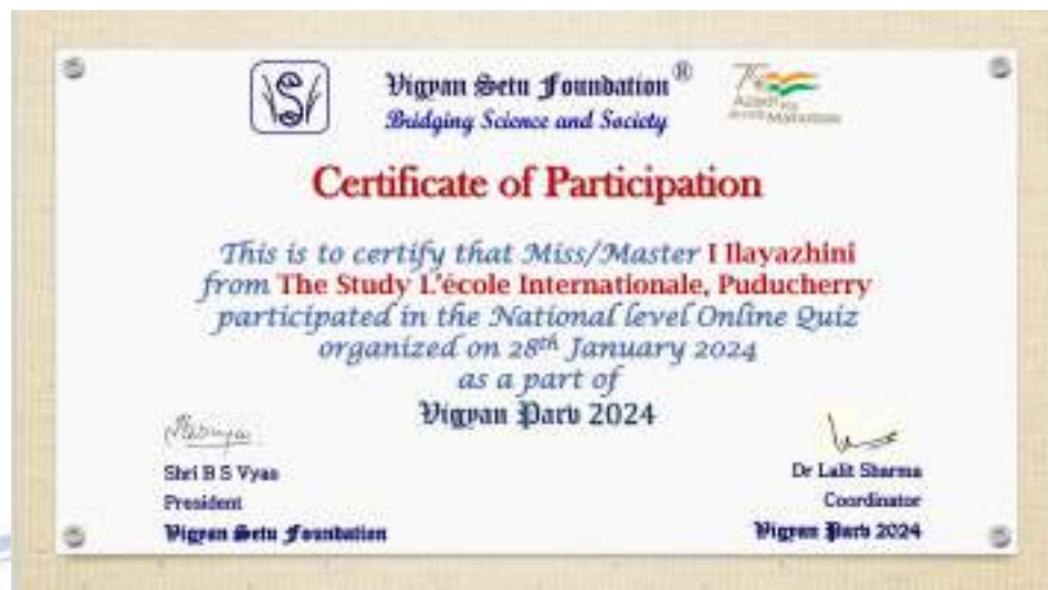
A sample Certificate of Participation